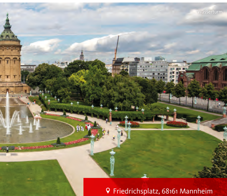
📍 Friedrichsplatz, 68161 Mannheim 🏛️ Wasserturm

it is a popular meeting place for both residents and visitors. An absolute must for your visit: a photo with Mannheim's most famous landmark! In the evenings, the historic lanterns and the historic water tower shine out brightly, providing a very special light show. You will get the best view from one of the cafés surrounding the square "Friedrichsplatz". Under the arcades with a café au lait in your hand, you will soon start to enjoy a Mediterranean "joie de vivre".